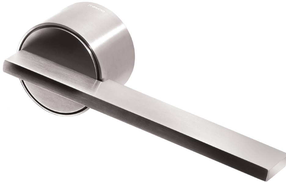
Shown in Satin Stainless Steel Finish