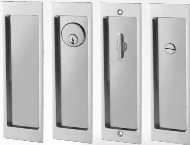
Blank Cylinder Turnknob Coin Release

7-1/2" (190 mm) x 2-3/8" (60 mm) x 1/16" (1.5mm) flange