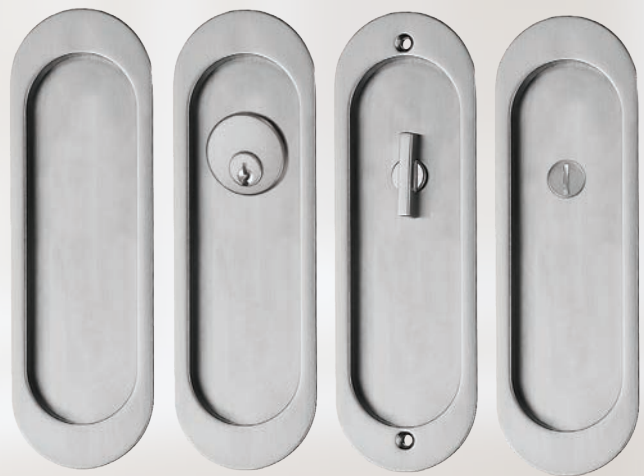
Blank Cylinder Turnknob Coin Release

7-1/2" (190 mm) x 2-3/8" (60 mm) x 7/64" (2.8mm) flange