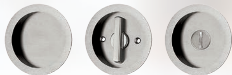
Blank Turnknob Coin Release

2-1/2" (63 mm) diameter x 7/64" (2.8 mm) flange