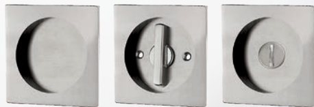
Blank Turnknob Coin Release

2-1/2" (65 mm) square x 7/64" (2.8 mm) flange